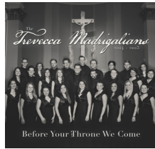
Before Your Throne We Come

Trevecca Nazarene University will be with us in our morning worship service. The Madrigalians are a select vocal ensemble that specializes in a cappella literature.